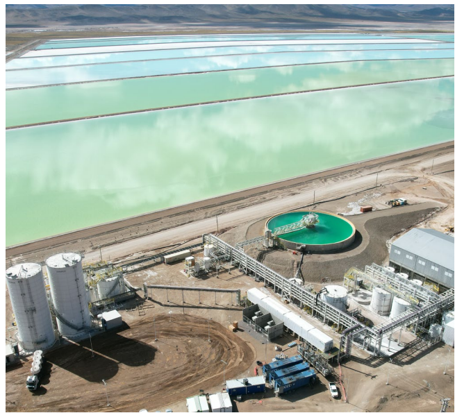
Figure B: Full production rate of 40,000 tpa of battery-quality lithium carbonate is expected by Q1 2024.