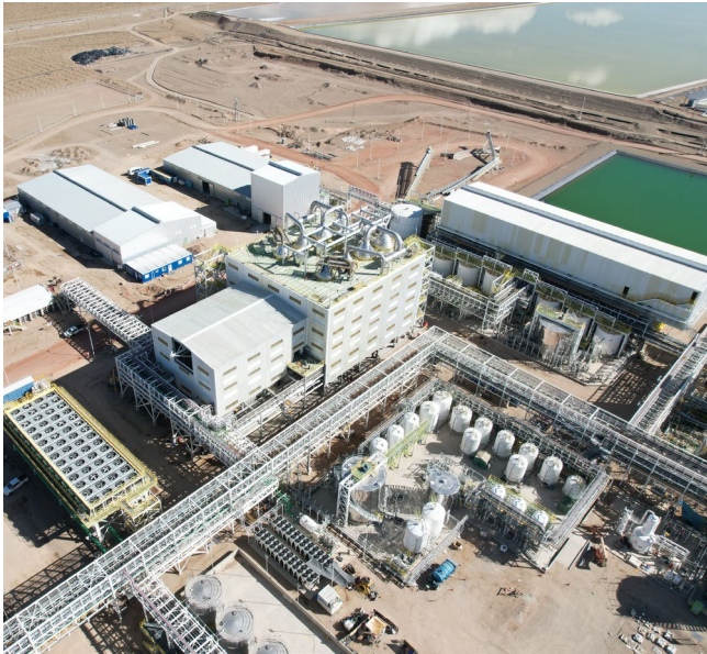
Figure A: Commissioning underway with first lithium targeted for June 2023.