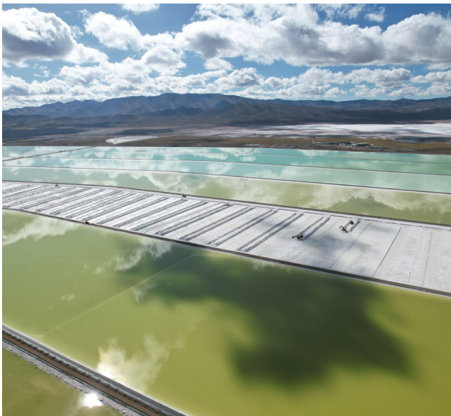
Figure C: Pond harvesting to service the evaporation ponds continues.